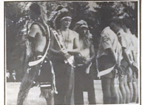
Members of the Brotherhood Tap-out team performing their duties at the October weekend.