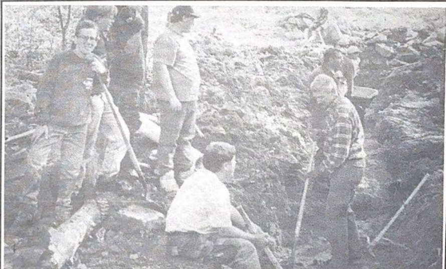
Wagon Lodge members take a breather from working on the Buck Run showerhouse last fall. Extra work weekends have been scheduled on May 8 and May 22 to finish the showerhouse for the camping season. Call Council office at 837-1630.

1. "Don't worry about it. That snake wasn't poisonous."