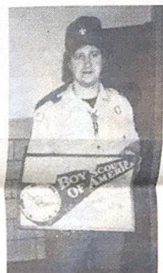
Royal Ferry, III